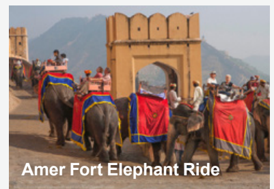
Amer Fort Elephant Ride