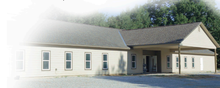
Exterior of standard church